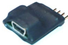
Figure 2. USB interface

The PC USB interface connects to the RC Altimeter #3 PRO module's 4-pin connector. The RC Altimeter #3 PRO gets power from the USB interface so no external battery is required. USB drivers can be downloaded from www.rc-electronics.org under Downloads -> Software. After installation a virtual COM port will be created. Please be sure that this virtual COM port is number 1...10.